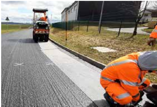
Pic. 3: ADFORS GlasGrid Rapid installation and adhesive layer activation