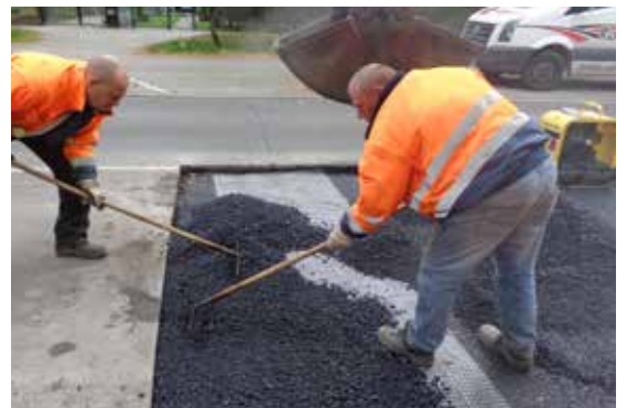
Pic. 18: HMA application over ADFORS GlasGrid Rapid