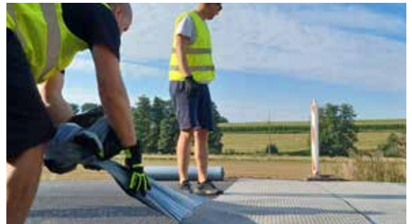
Pic. 7: Then take the foil off