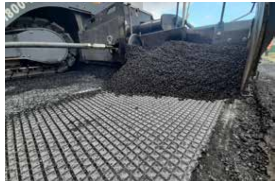
Pic. 17: HMA application over ADFORS GlasGrid Rapid