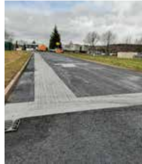
Pic. 12: Longitudinal & transverse cracking