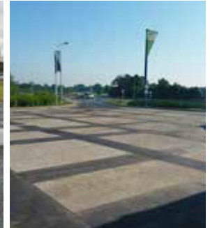
Pic. 13: Cement concrete joints