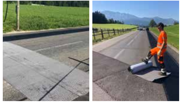
Pic. 10 & 11: Overlaps of reflective cracks