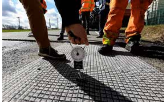
Pic. 16: Adhesion pull out test