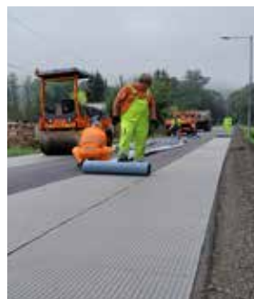
Pic. 8: Shoulder reinforcement