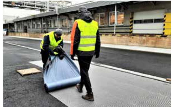
Pic. 4: ADFORS GlasGrid Rapid instalation