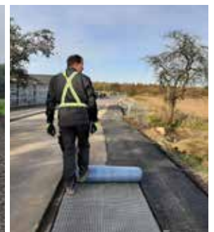
Pic. 9: Lane widening reinforcement