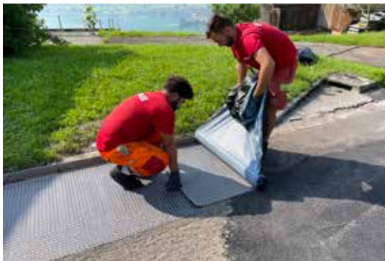
Pic. 2: ADFORS GlasGrid Rapid application for local repairs