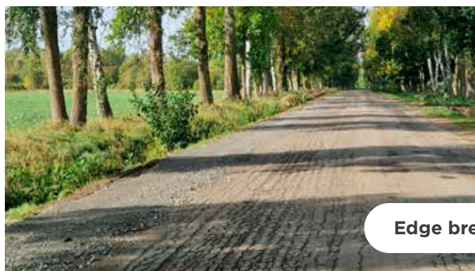
Edge break cracking