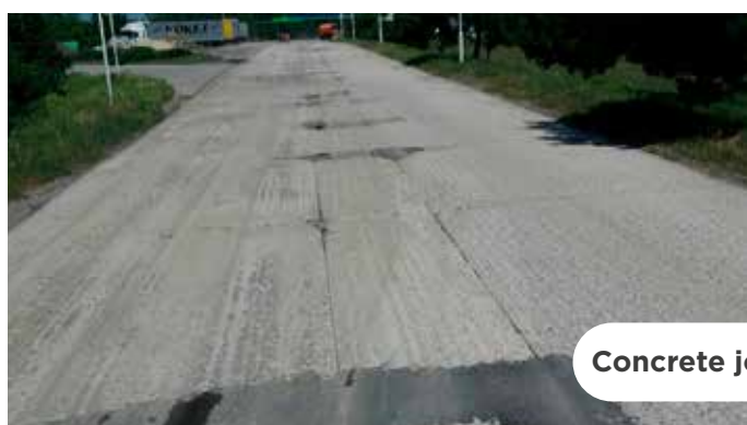
Concrete joints cracking