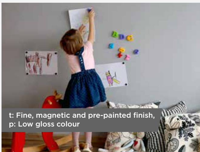
t: Fine, magnetic and pre-painted finish, p: Low gloss colour