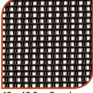
40 x 40 Sun Guard

ADFORS .140" spline is recommended for the best fit in a standard frame.