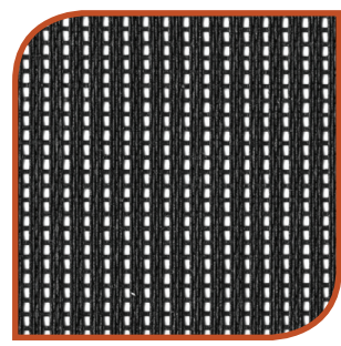
54 x 18 Sun Guard

Sun Guard screen is available in DIY pre-cut and 100' contractor rolls. Each pre-cut roll comes with simple step-by-step instructions for easy installation.